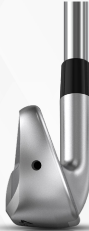
UHX HOLLOW 4I Wider sole, less V-Shape

The hollow series (4i-7i) irons feature a less distinct V-Shaped Soles for more forgiveness and improved ball speeds. Meanwhile, the cavity back irons feature a more pronounced V-Shaped Sole for more bounce and better turf interaction in the scoring clubs.