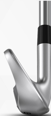
UHX CAVITY BACK 8I Thinner sole, more V-Shape