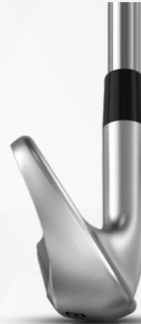
UHX CAVITY BACK 8I Thinner sole, more V-Shape