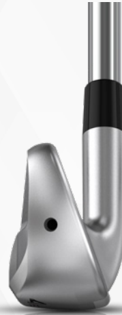
UHX HOLLOW 4I Wider sole, less V-Shape

The hollow series (4i-7i) irons feature a less distinct V-Shaped Soles for more forgiveness and improved ball speeds. Meanwhile, the cavity back irons feature a more pronounced V-Shaped Sole for more bounce and better turf interaction in the scoring clubs.