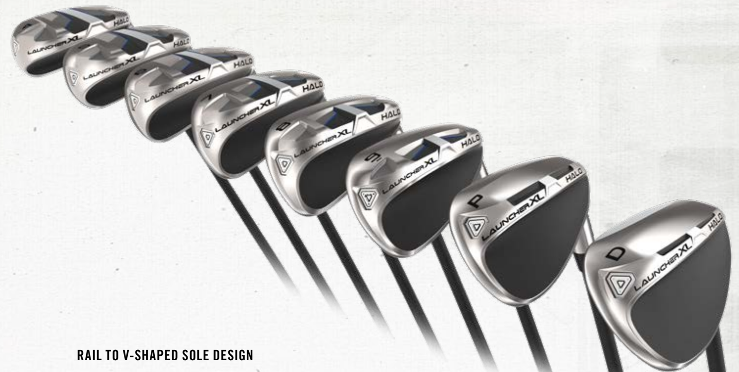
RAIL TO V-SHAPED SOLE DESIGN